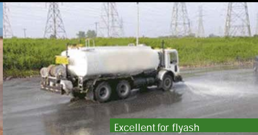
Excellent for flyash