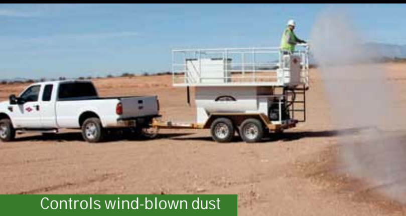
Controls wind-blown dust